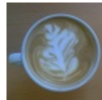
A selection of Gill's first attempts